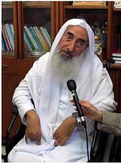
Sheikh Ahmed Yassin