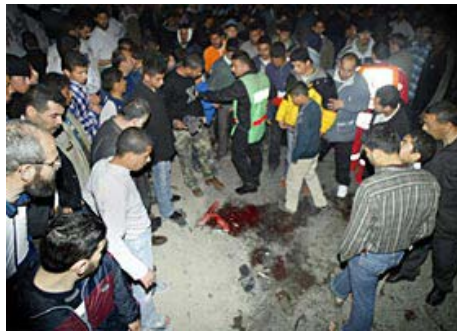
March 22, 2004, scene of assassination