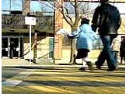
United Talmud Torah