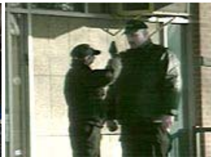
Law enforcement agents at scene